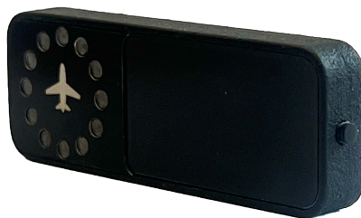
Figure 1. LX Flarm LED Display Pro

The LX Flarm LED Display Pro (part number LX02000451) is a compact cockpit instrument designed to work alongside your FLARM collision-avoidance unit. It presents nearby traffic information and alert status at a glance using a bright 1.5" sunlight-readable display and a surrounding ring of colored LEDs visible in peripheral vision.