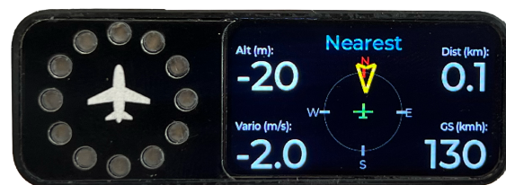
Figure 5. Nearest traffic idle screen

Shows the closest aircraft currently tracked by your FLARM, even if it is not a declared threat. Useful for maintaining situational awareness near other known gliders.