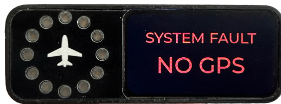
Figure 10. NO GPS fault screen

The following screens appear when a condition prevents the display from operating correctly.