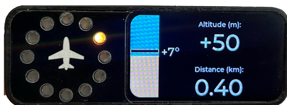
Figure 7. Standard collision warning screen

When it appears: For the majority of traffic encounters — aircraft crossing your path, approaching from the side, overtaking, or converging from any direction other than directly ahead.