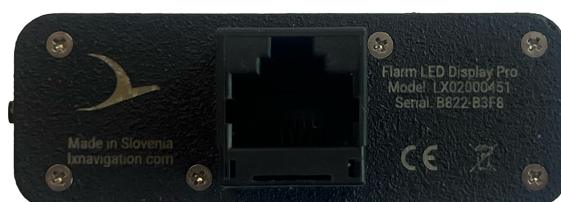
Figure 3. RJ45 connector on the rear of the device