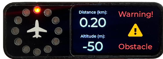
Figure 9. Obstacle warning screen

When it appears: Your FLARM database contains a known fixed obstacle ahead — a radio tower, cable car installation, high-tension power line, or similar.