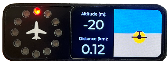
Figure 8. Head-on collision warning screen