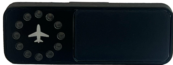
Figure 2. LX Flarm LED Display Pro

The LX Flarm LED Display Pro is supplied as a bare device only.