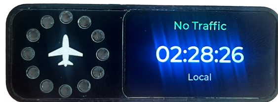
Figure 4. Clock idle screen

A large, easy-to-read time display derived directly from the FLARM GPS receiver, updated every second. Highly accurate and requires no maintenance. The time zone offset can be adjusted in the Settings menu, or left at UTC.