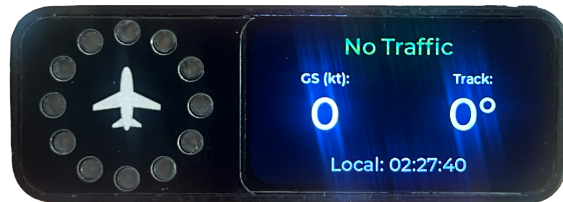
Figure 6. Own ship idle screen

Shows your current ground speed and track angle, sourced live from your FLARM GPS receiver and updated every second.